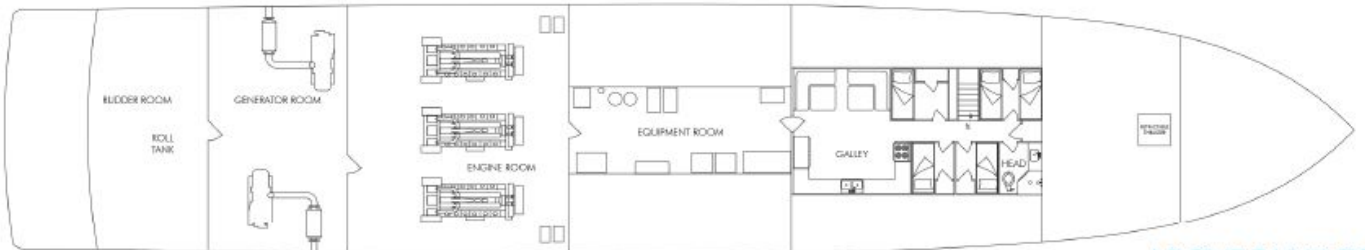
ABOVE TANK TOP